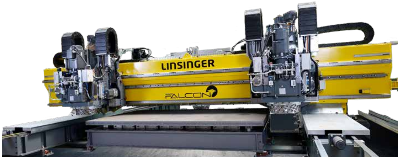
Gantry Milling Machine PFM FALCON

The machine covers easily plates with wall thicknesses from 10mm up to 200mm (0,4 – 8"). The high-power reserves of the machine ensure maximum torque of 6000 Nm and high feed rates even when heavy plates are milled. Various profile types (N/V/X/Y/J) can be realized. The proven copying function of the milling unit ensures a constant web-flow along the plate edge, even on heavily bent plates of high thickness.