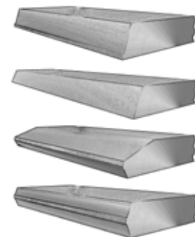
Plate Edge Profiles

The details, data and drawings etc. contained in all brochures/catalogues of LINSINGER are purely of informational nature and these details explicitly cannot be interpreted in order to derive any claims whatsoever against Linsinger. The details etc. are only binding for LINSINGER if they expressly become part of a contract concluded between LINSINGER and the Buyer or if they are confirmed in writing by LINSINGER in the course of an order confirmation.